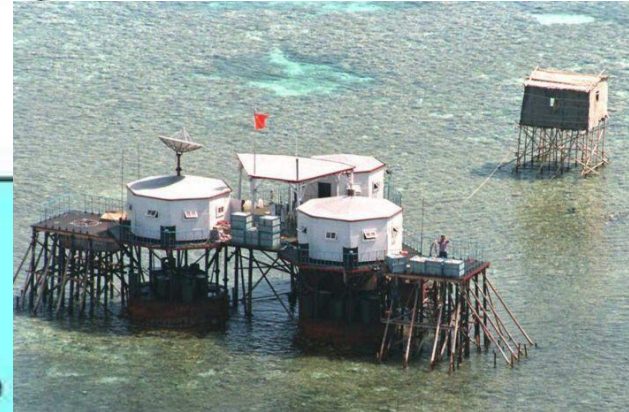
Maritime and Airspace Zones (UNCLOS)